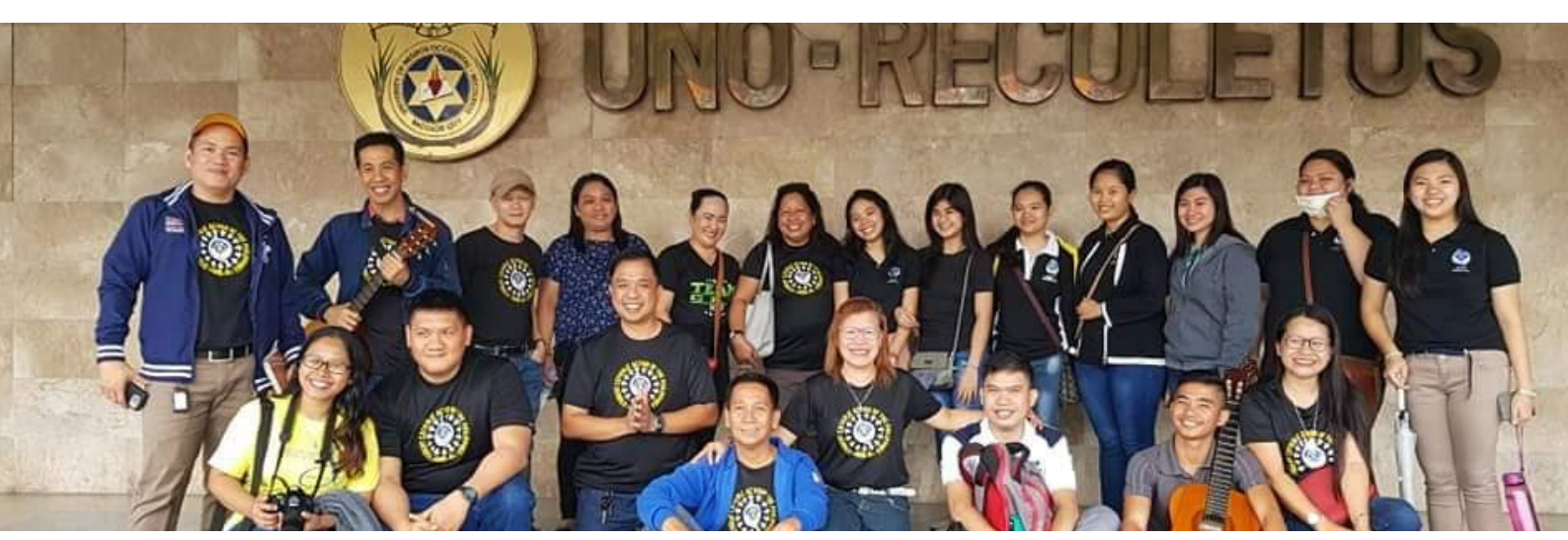
SCA Bacolod Alumni pose before their Alma Mater's Main Entrance

BACOLOD CITY - The Student Catholic Action Alumni Association (SCAAA) of the University of Negros Occidental-Recoletos (UNOR) celebrated its annual alumni homecoming and outreach last December 29, 2018. The group chose a community and kicked off a children's apostolate as a way of sharing the blessings of SCAP Alumni.