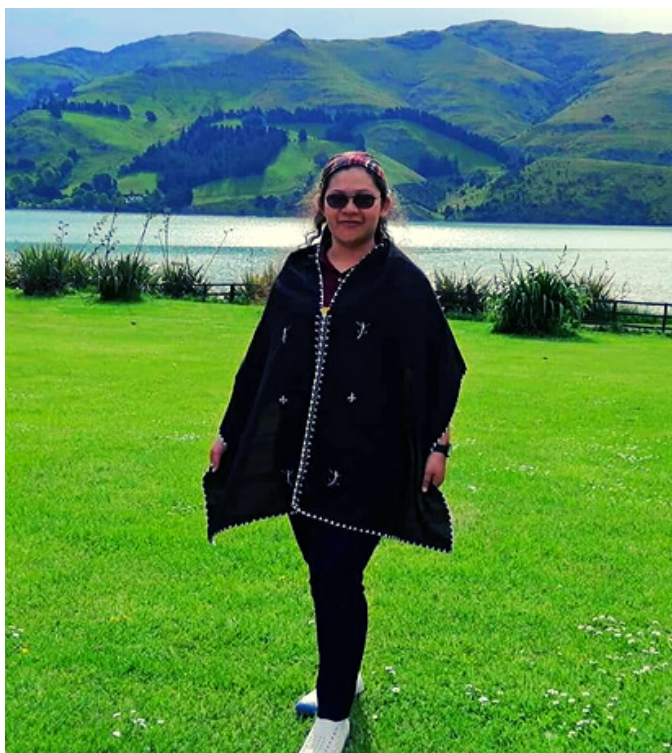
PHOTO: The author enjoying the New Zealand landscape.

Another thing is I find the bus system here very efficient (there is an online app to check the schedule). Lastly, leftovers are not encouraged when consuming meals. The waste segregation is strictly followed, and I barely saw sachets in groceries. Instead, shampoo containers are readily available.