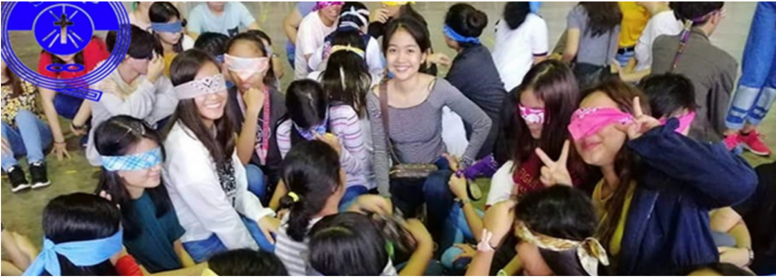
PHOTO: New SCA members of Sacred Heart College in Lucena enjoy a blind-fold activity during their eSCAPade.