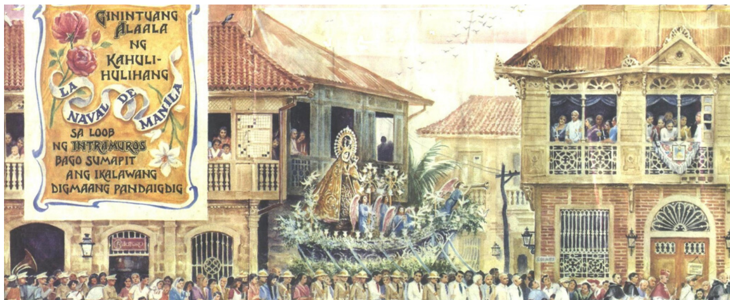
PHOTO: La Naval de Manila Procession Diptych. Rafael del Casal. 1990