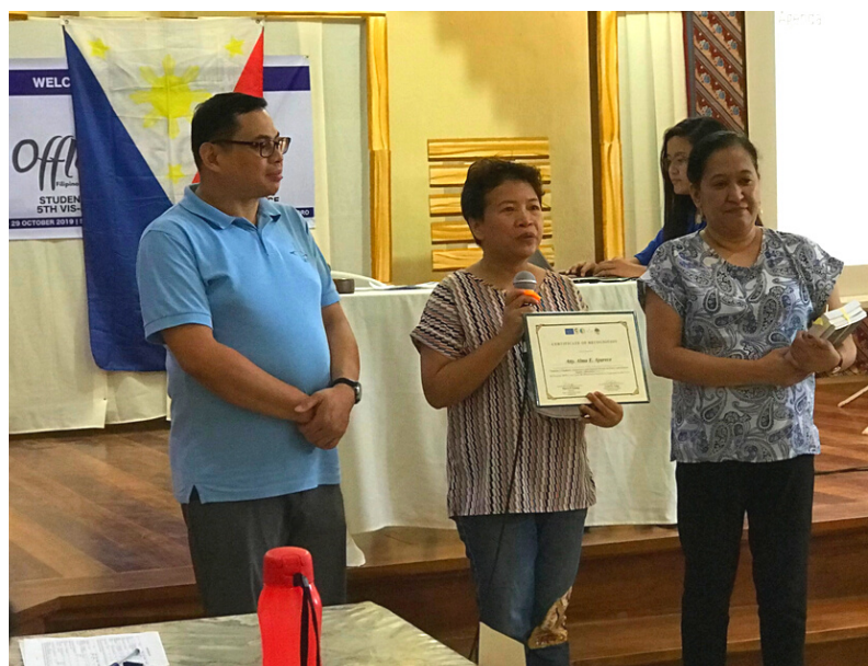
PHOTOS: The resource facilitators focused on peace and social justice during the 5th SCAP VisMin Regional Leadership Conference in the Archdiocese of Cagayan de Oro

Cagayan de Oro City - Sixty (60) student leaders (high school and college) including their animators from the arch/dioceses of Bacolod, Cebu, Talibon, Tagbilaran, Tandag and host-organizer, CDO converged for the 5th Student Catholic Action of the Philippines Visayas-Mindanao Regional Leadership Conference to reflect and act on the theme, " Offline is Online: The Filipino Youth, Champions and Influencers of Digital Virtues and Citizenship ". The conference was held at San Jose de Mindanao Seminary from 26th to 29th of October this year.