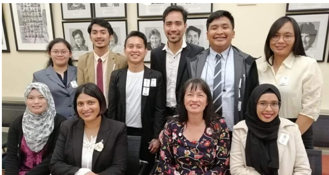
PHOTO: The author on both photos (left-first photo and upper left-second photo) actively engages with the delegates and mentors of the leaders program in New Zealand.

SCA built the leader in me. Being a SCAn prepared me for a challenging yet surprising future.